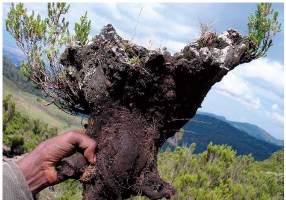
Figure 5. Lignotuber of Erica trimera from which new shoots arise after each fire.