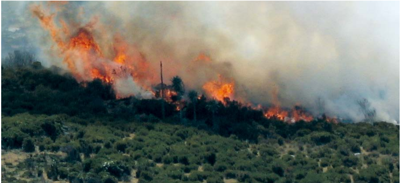
Figure 6. Heathland fire on February 4 th , 2008 at 12.40 pm. The longest flames are approx. 8 meters long. The burning Erica shrubs are about 2 metres tall. The lower shrubs in the foreground are approx. 1 metre tall.

fire elimination would be successful, since large tracts of highly flammable vegetation would soon develop. To successfully preserve these ecosystems, and the livelihoods of the pastoralists, we recommend that the authorities develop a joint management plan, together with the local people, allowing burning, but with defined prescriptions concerning fire intervals and fire weather.