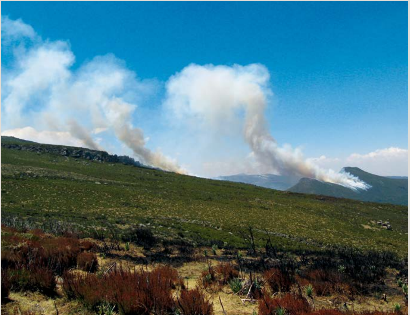
Pasture burning in the heathland landscape during the dry period, February 4 th 2008, at 12.10 pm.