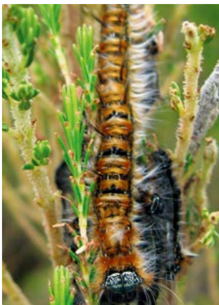
Figure 3. "Bokata", a moth caterpillar. It is covered by urticating hairs which cause respiratory and skin disease in the cattle.

The results showed that fire prevention is not a viable option for the heathland. It would deteriorate pasture quality and it is also unlikely that long-term