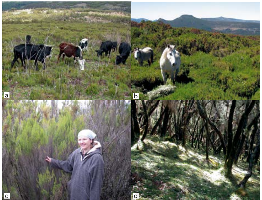
Figure 4. Tree heather stands in different post-fire successional stages: a) two years after fire b) five years c) eleven years, with plenty of fine dead fuels in the shrub layer d) approx. 50 years after fire, with the canopy separated from the hard-grazed field layer.

Since the young stands cannot burn, the heather cannot be eliminated by too frequent fires. As the shrubs grow taller and