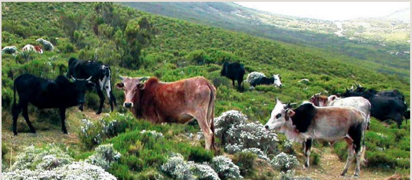
Figure 2. Highland cattle in the heathland landscape in the Bale Mountains during the dry period. A few taller shrubs of Erica arborea are visible behind the cows to the left, Erica trimera dominates in the rest of the picture. In the foreground, white cushions of a thorny everlasting plant, Helichrysum citrispinum , are seen.

■ Burning is often necessary to create pasture. In Sweden pasture burning used to be common, but was prohibited when it came into conflict with timber interests. Centuries of pasture burning here created heathlands with a unique biodiversity, which are today threatened by reforestation.