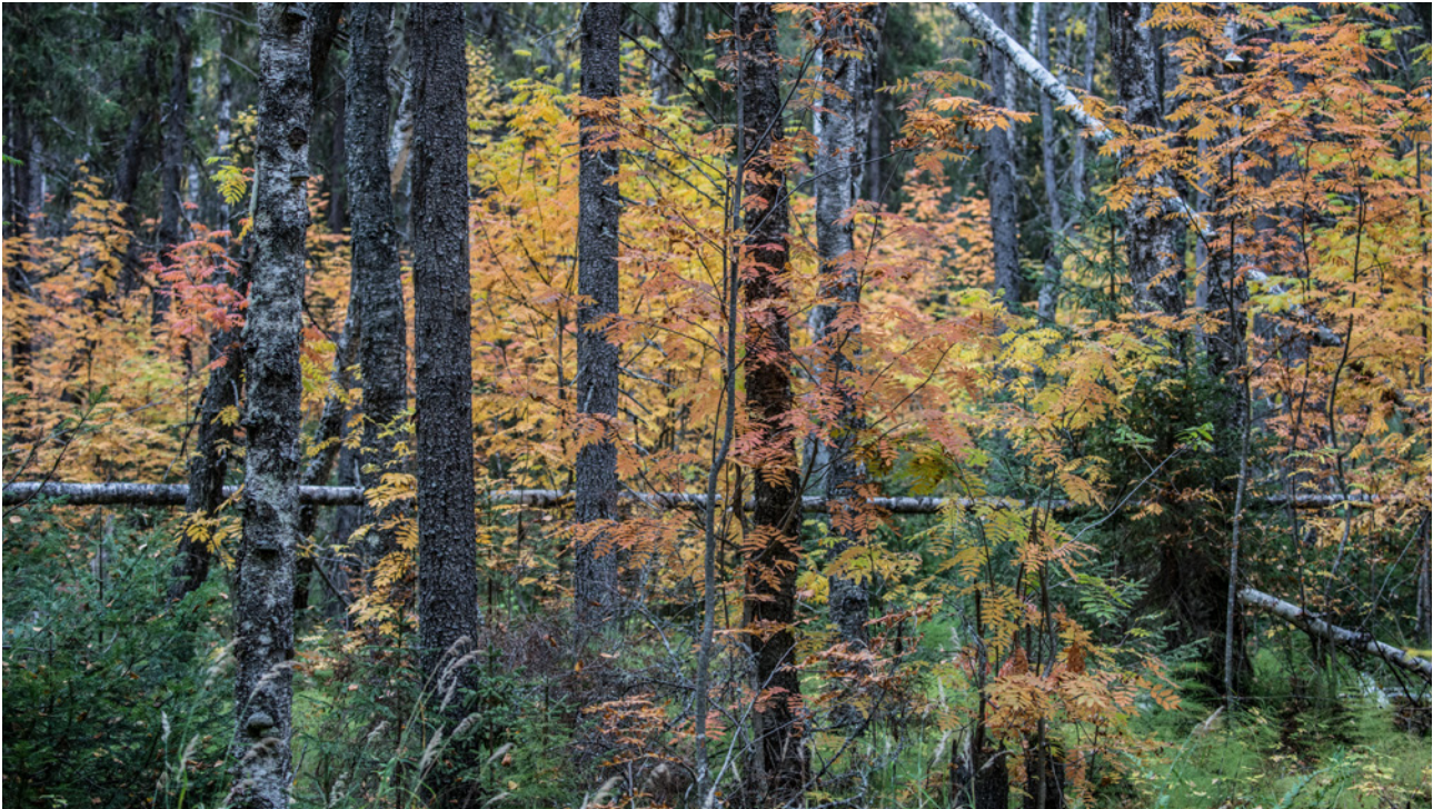
A forest, with multiple vertical layers, in Komi Republic. This type of forest is valuable for traditional hunting due to the diversity of habitats for wildlife.

Free, prior and informed consent (FPIC) is an important human rights principle, supported by Indigenous peoples worldwide and enshrined in the United Nations Declaration on the Rights of Indigenous Peoples (UNDRIP). Indigenous Peoples define FPIC as an expression of their collective right to self-determination, including the possibility to accept or reject a resource development project that will affect their rights, based on a collective decision-making process.