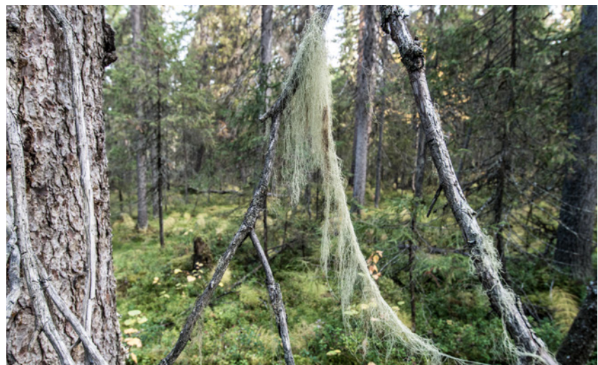
An old-growth forest with hanging lichen in Sweden. Lichen is a crucial food source for reindeer, thus protection of old-growth forests are a pivotal issue for Sami reindeer herders. Reindeer is a keystone species in Scandinavia and the Sámi have a long history of living off reindeer for livelihood (front page).

The approach taken in the process was to develop indicators which would be in line with the previous standard, a relatively prescriptive and standardized approach. The biggest challenge was agreeing on the parameters for consent. Indigenous members of the Social Chamber argued that the Sami should have strong decision-making influence under FPIC, in line with conceptions in the IGIs. For them, FPIC was viewed as an important mechanism to redress what was seen as a legacy of imbalanced power dynamics within consultation processes. For members of the Economic Chamber, there