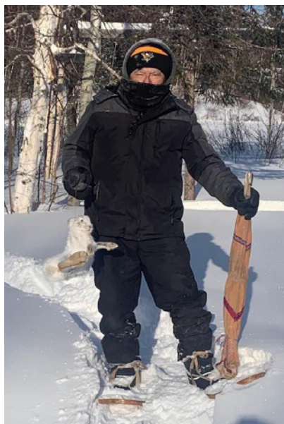
A Cree hunter from an inland Cree community poses with a rabbit snared from one of the hunting grounds in the James Bay region of Canada.

were concerns around the potential for veto and impacts on management planning and corporate stability. There was clear consensus that FPIC rights should not be extended to local communities under Principle 4.