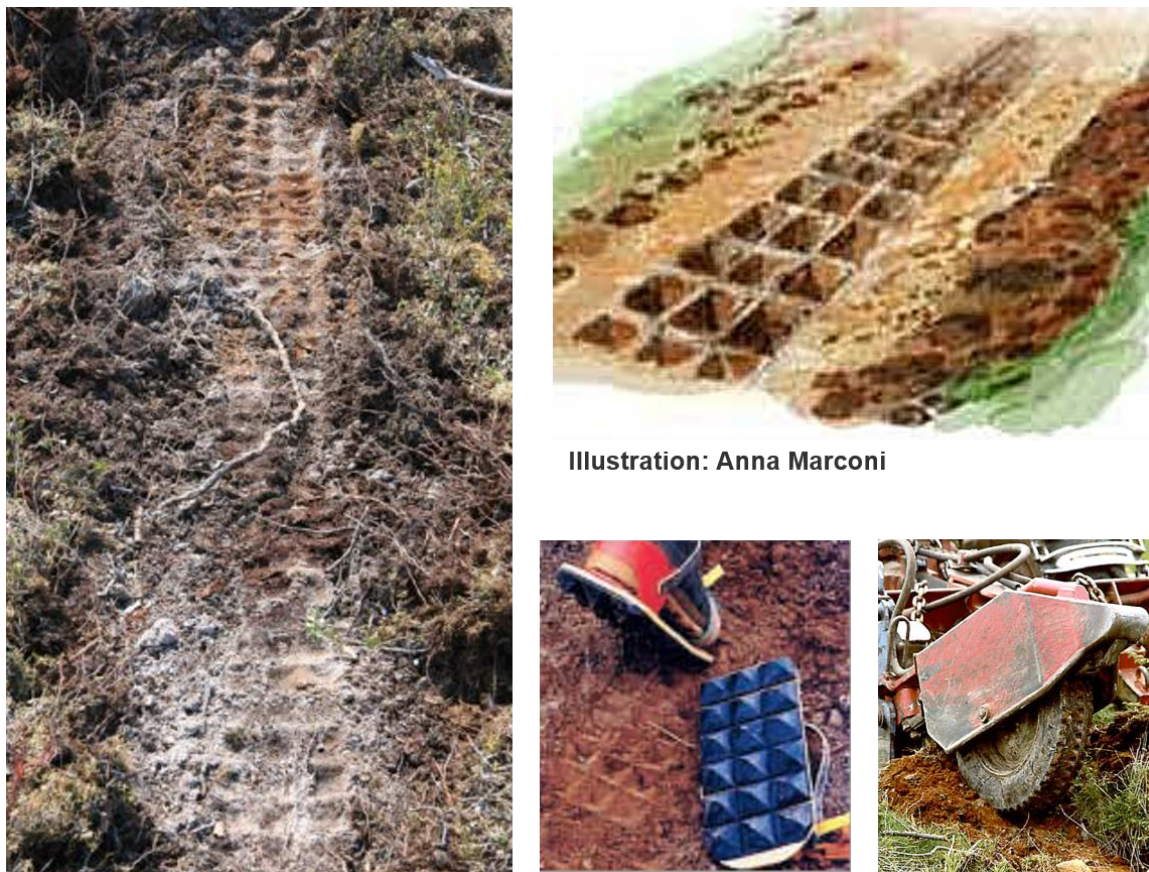
Illustration: Anna Marconi

Spot seeding is generally performed using intermittently advancing machines, often in long patches via directed site preparation with a crane. During directed site preparation, the operator actively chooses where the soil preparation takes place and where the seeds are sown. Directed site preparation (and thus spot seeding) is suitable on rocky, steep, or uneven terrain (Johansson 2016), and on sites/blocks that are irregular or small.