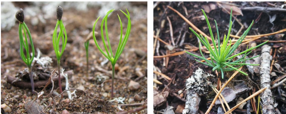
Figure 1. Germinants of pine on site-prepared forest soil (left), and a seedling one year after seeding (right).

An advantage of direct seeding compared to natural regeneration is that you do not become dependent on good seed years or the nearby presence of enough seed trees. This advantage becomes increasingly important the further north and the higher above sea level you are, because years of good seed maturity and cone occurrence become rarer the colder the climate is (Hagner 1958).