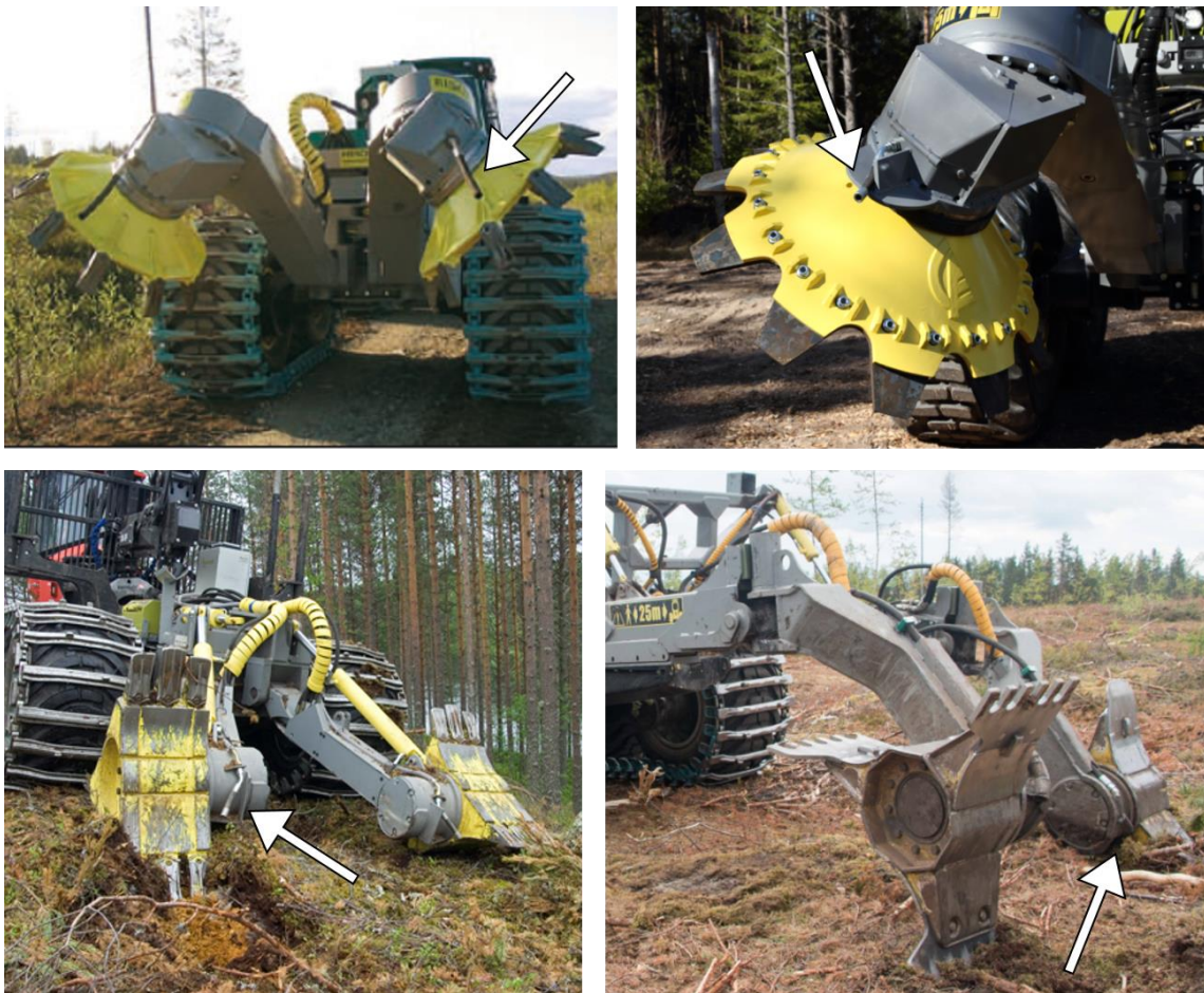
Figure 6. Mechanized direct seeding through hoses mounted on modern disc trenching units (top) and mounding units (bottom). Disc trenching units with standard discs (with worn-down excavator teeth, left) and newly developed discs (with durable plates instead of excavator teeth, right). Mounding units with side-mounted seeding hoses and standard three-pointed mattock wheels (with excavator teeth, left) and newly developed three-pointed mattock wheels (with "almost-micro-preparing" cutting teeth on one mattock wheel and durable plates on the other mattock wheel, right). The white arrows point to where the seeds come out.