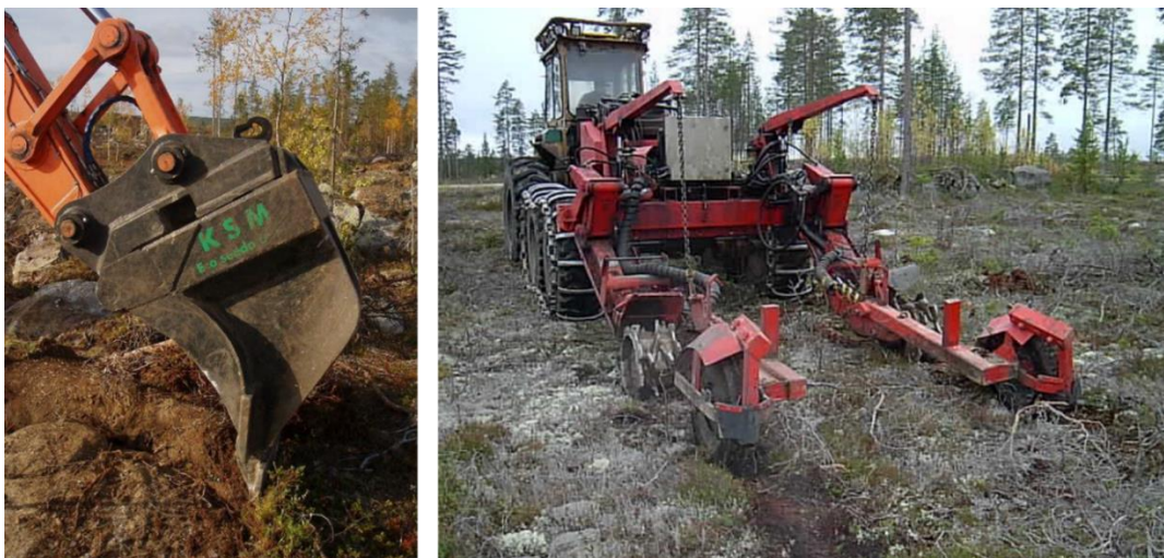
Figure 7. Examples of specifically designed devices for mechanized direct seeding: the KSM bucket (a crane/boom-mounted seeding bucket, left) on an excavator for direct seeding in patches; the HuMinMix (Humus Mineral soil Mix, right) mounted on a forwarder for continuously advancing row seeding in rototilled, micro-prepared, shallow trenches.

The third device was the KSM seeding bucket, a bucket for mounting on excavator cranes/booms (Figure 7). With KSM, the operator creates long patches where the humus is scraped off and seeds are sown simultaneously. The combination of KSM unit and excavator produces good seeding results even on rockier soils (Nilsson 2009). The seed dispenser is located on the bucket and the seeds are fed relatively evenly using a disc, 30-40 seeds per crane cycle. According to the manufacturer, about ten units have been sold, mainly for use in northern Sweden, with a number of units still in operation during the spring of 2021.