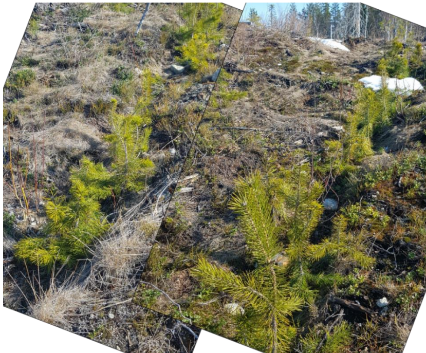
Figure 2. Plenty of seedlings in disc trenched furrows 4 years after direct seeding in the interior of Västerbotten, northern Sweden.