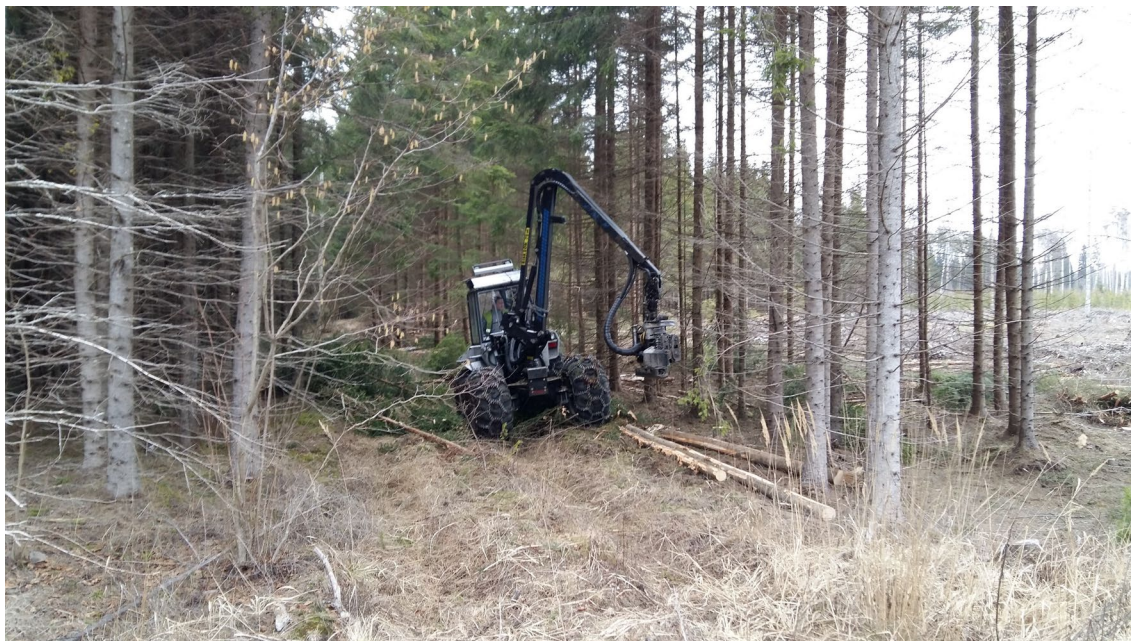
Figure 22: Harvester Vimek 404 T5 28 .

Forwarding is done using compact class machine Kranman Bison 10000 6WD and middle class forwarder John Deere 810D.