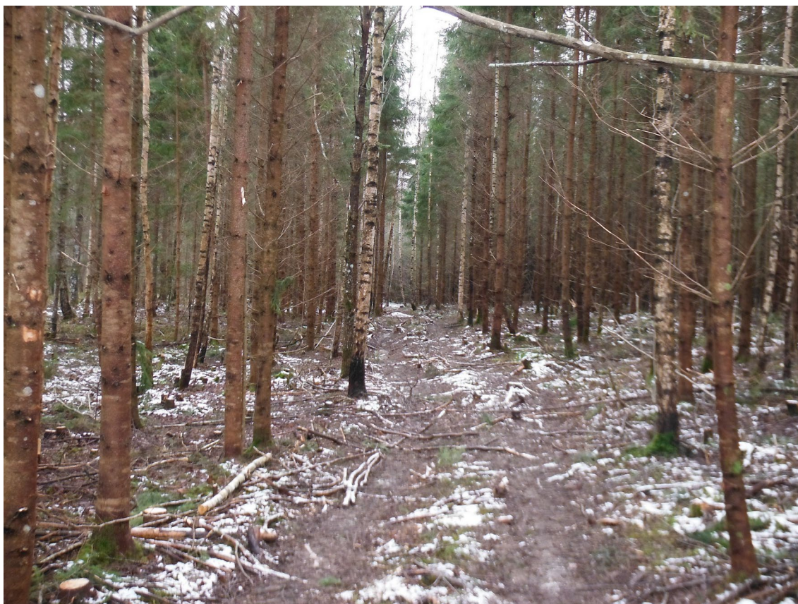
Figure 21: Stand characteristics after thinning 26 .