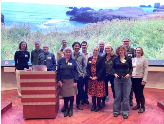
Organizers and speakers of the meeting