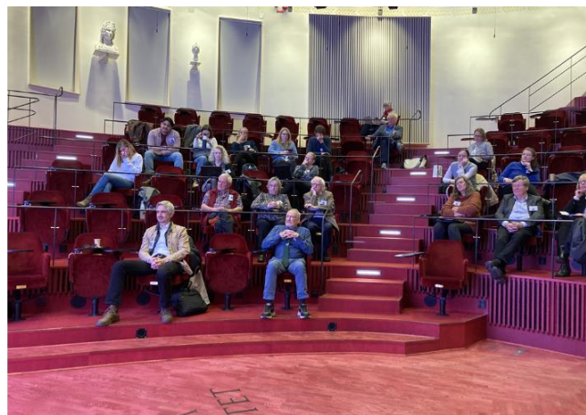
Some meeting participants in the Humanities Theatre