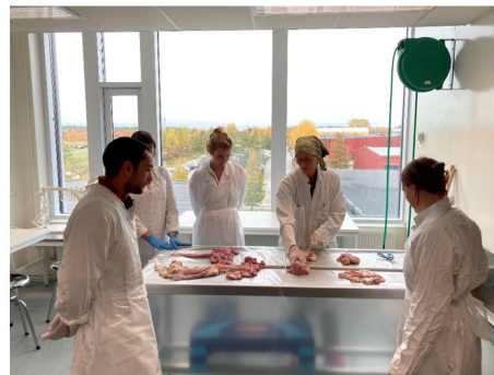
Practical sessions in the VHC building: AI demonstrations with organs and CASA demonstrations