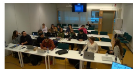
Discussions in Tannggrisner 1