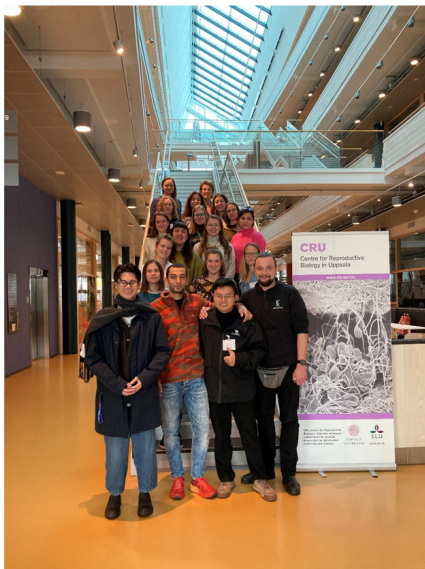
Course participants and some of the lecturers in the VHC building

This course was organized with contributions from CRU, GS-VMAS and the SLU platforms Developmental biology and Cells for Life. The course was held at SLU, campus Ultuna and UU, Humanities theatre and 20 participants were admitted to take the course. Of these 18 participants followed and passed the course. Course participants were actively networking and found future colleagues and collaborators within the field of reproductive biotechnologies among both speakers and participants. The course had over 20 speakers and practical session organizers: we are most grateful for the fantastic work everybody put into the course. One day of the course was included in the CRU annual networking day with three longer lectures followed by eight short presentations on various research subjects connected to reproductive biology. Course evaluations were very positive and we hope to be able to give a new version of the course in a few years' time. Please see the schedule and syllabus below.