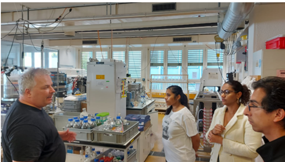
FFB - PhD students at Food Process Engineering Laboratory - ETH Zürich.